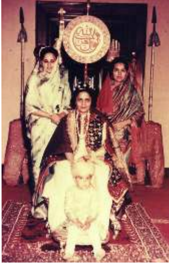
L-R Princess Saleha Sultan, HH Sajida Sultan Begum of Bhopal, Prince Aamer bin Jung, Princess Sabiha Sultan with the mah-i-maratib and other honors of Bhopal State

The selfless devotion of the Begum's to their people resonates in the architecture of Bhopal. The Begum's were intimately involved in making Bhopal one of the most beautiful cities to live in. Their work can be seen till date through the magnificent buildings that adorn Bhopal like little jewels, each offering a stately presence and each signifying secularism, peace and harmony for the people living within the walls of the city.