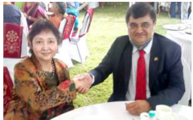
Hon'ble Mr.Suresh Mohan wishing H.E Consul General of Japan