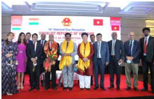
Inuguration of Consualte of Socialist Republic of Vietnam at Bangalore