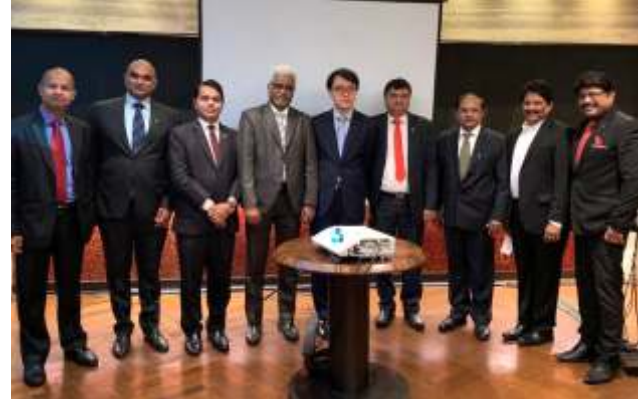
Event hosted by Consulate of Korea