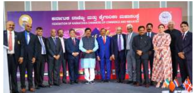
Consular Day event hosted by FKCCI