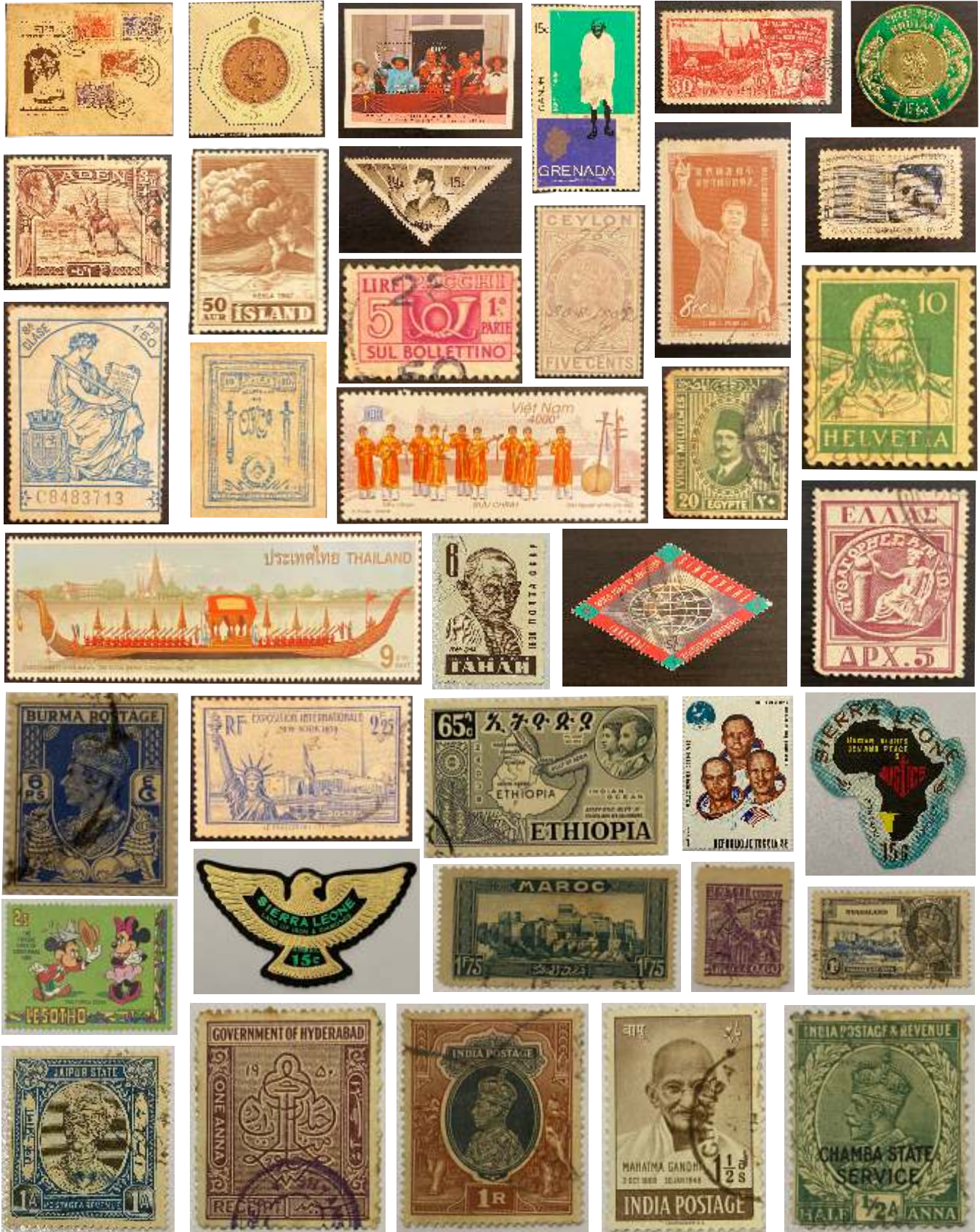
Details - Wikipedia History of Stamps - Stamps from the Private collection of Vaswani Family