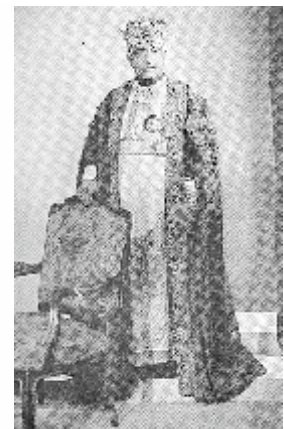
(1901-26) Sultan Jahan Begum