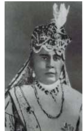
(1868-1901) Shahjehan Begum

My grandmother would often tell me that religion is just a thief's ruse to steal another man's wealth. She said this way back in the 1980's that religion was used in 1947 and will continue to be used time and time again for vote bank politics. "The Begum's detested religion as a tool of governance." She would often tell us.