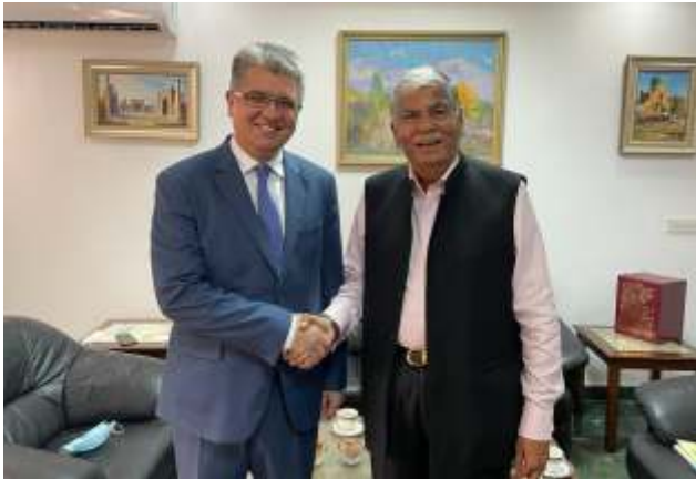
Greeting Dilahod Akhaov - Consul General of Uzbekistan