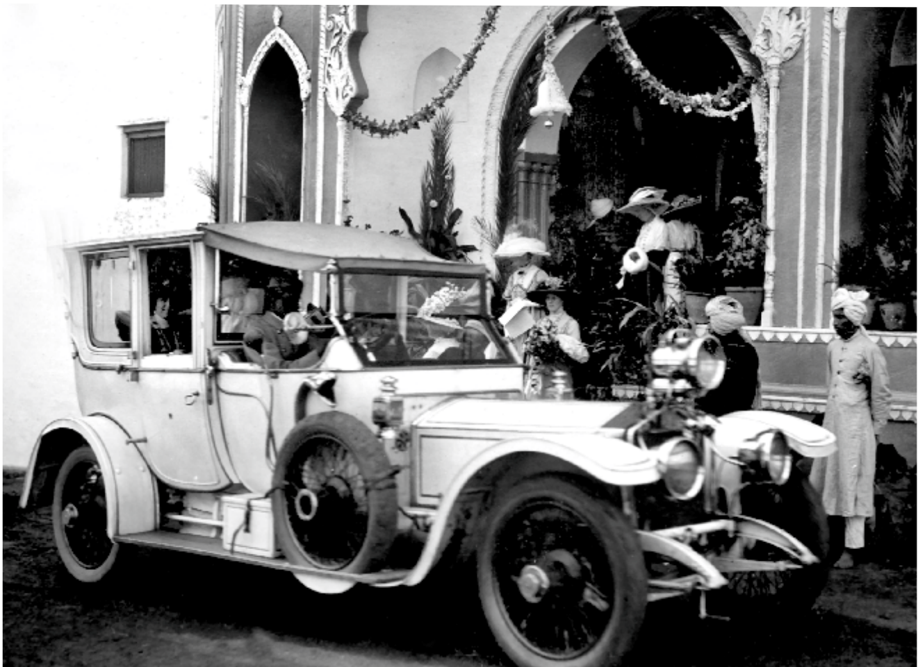
S Jehan Begum Darbar Hal Sadar Manzil