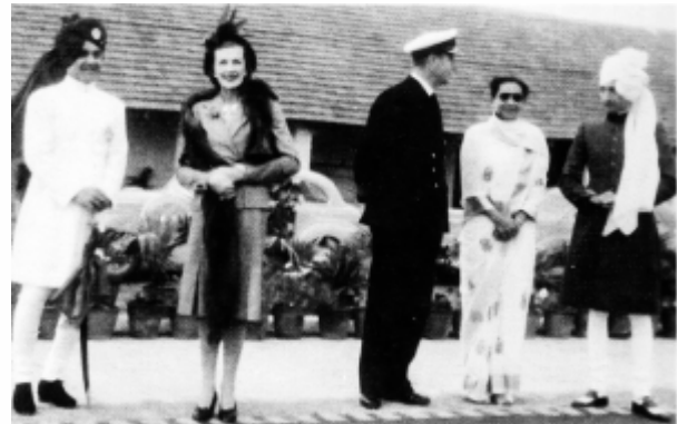
Circa 1948 Mt Batten, Lady Mt Batten HH Princess, Nawab IAK Pataudi

of the family. The Asleh Khana staff (armoury), drivers and cooks would complete the rest of the inner coterie of staff. Advance scouts and follow cars had to go with us. Life in the palace, when we were young and growing up, meant little to us but after 1971 with the abolishment of the privy purse, we realized exactly how fortunate we had been to see a life that few in the world would ever get a glimpse of.