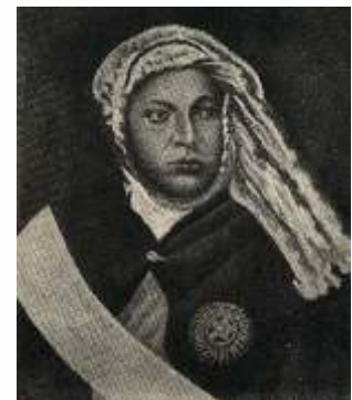
(1847-68) Nawab Sikandar Jehan Begum