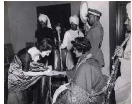
HH Sajida Sultan Begum of Bhopal receiving nazrana

If you ever visit Bhopal, take a rickshaw or walk the streets; look for old WWII jeeps, batwas, eat traditional Bhopali food and study the old architecture. The work of the Begum's is seeped deep in every fiber of the proud Bhopali. You can then decide for yourself on the impact the Begum's have had on their people. As for me, I endeavor to return to Bhopal to revel in their selfless devotion to Bhopal and in my own way promise to try and make a difference, albeit a small one.