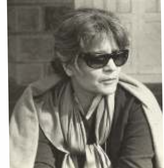
1962-96 HH Begum Sajida Sultan Bhopal

The Begum's loved their forests passionately. State administration was based out of Bhopal but was run from Chiklod on most occasions, our private lodge in the bush overlooking a lake. Forest and conservation were an integral part of their administration. Issuing of weapons to the public was restricted through licensing and hunting licenses given based on carrying capacity of different regions. Only the first family and their personal guests were allowed to hunt in the 'shikar gahs'. This proved extremely beneficial for the wildlife as few animals were killed on a yearly basis.