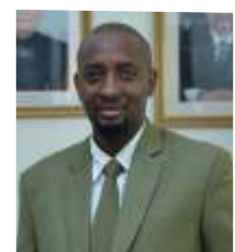
High Commissioner Republic of Namibia