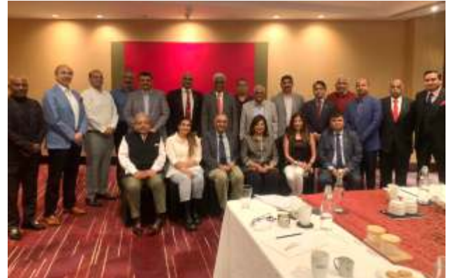
Meeting of Bangalore Chapter