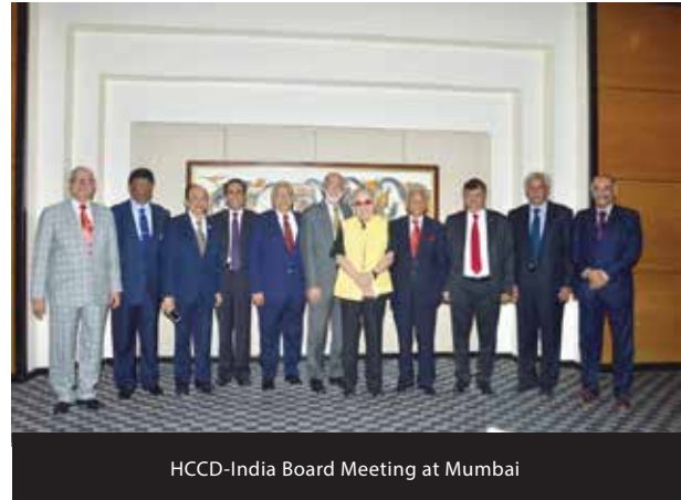
HCCD-India Board Meeting at Mumbai

A sum of Rs. 1.02 crores was presented to the families of all those who lost their lives on that fateful day through "Brave Hearts" an initiative of Ministry of Home Affairs. This was through the Union Minister Rijiju. A cheque of Rs. 21 lakhs was presented to Mr. Devendra Fadnavis, for the families of those who were killed on 26/11, nine years ago.