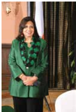
St Patrick's Day Celebrations – Dr. Kiran Mazumdar Shaw - Honorary Consul of Ireland