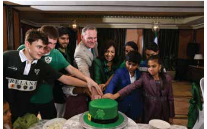
St Patrick's Day - Cake Cutting Ceremony