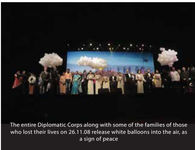
The entire Diplomatic Corps along with some of the families of those who lost their lives on 26.11.08 release white balloons into the air, as a sign of peace