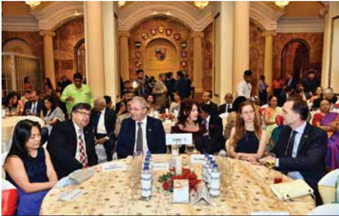
British Deputy High Commissioner and Consul General of France at Latvia National Day Celebrations